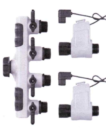
Hover Image to Zoom