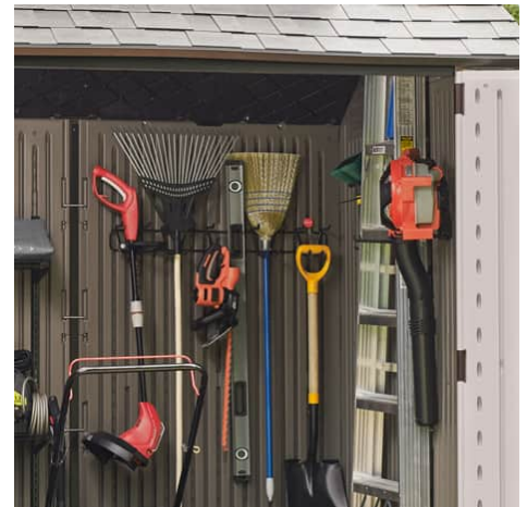
50% More Wall Strength for Durability*

Designed with Rubbermaid's durability standards, this shed has 33% fewer parts for a faster and easier assembly*.