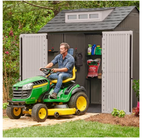
180° Door Opening

Double wall construction and robust, wall-connector pins prevent warping caused by weather or weight.