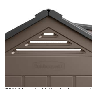
50% More Ventilation for Improved Air Flow*

Rain gutter helps with water management, providing protection through all seasons.