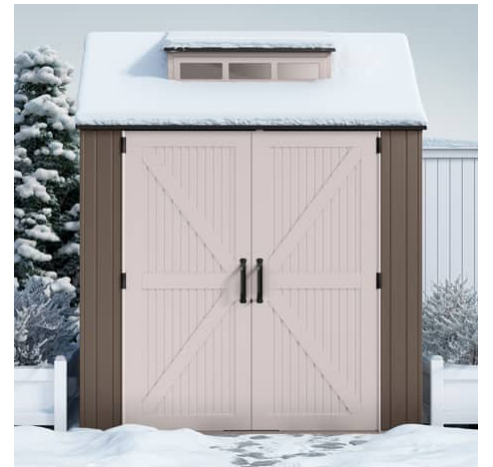
50% Stronger Roof to Support Heavier Snowfall* Roof supports heavier snowfall* by withstanding loads up to 15

Doors open a full 180^{\circ} for convenient access to large items.