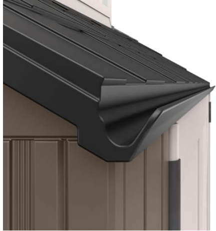
Integrated Rain Gutter

Rain gutter helps with water management, providing protection through all seasons.